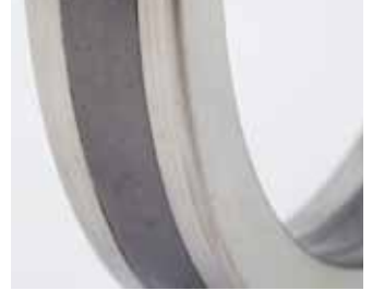
Autoclave rings with and without cups.

The information given in this document is for guidance only and does not commit LATTY international in any way. LATTY international does not warrant the performance of its products, unless properly fitted and used in accordance with the instructions, nor can it accept any claim for consequential liability.LATTY International S.A. is only liable for the quality of its products as it does not involve itself in their fitting or use, which must be done in accordance with the instructions.