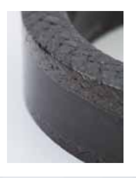
Composite ring consisting of a central ring of expanded graphite with compressed braided rings at the ends. The set provides a perfect sealing up to 1000 bar.