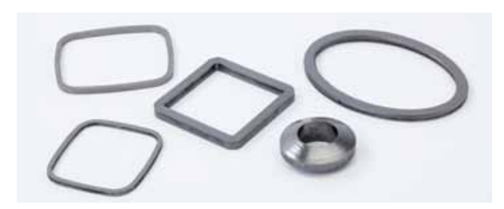
From a simple specification, we can realise upon request all forms, sizes and quantities of expanded graphite rings.